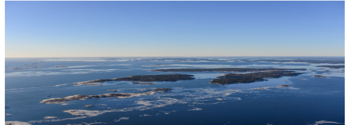
PEOPLE AND GOVERNANCE