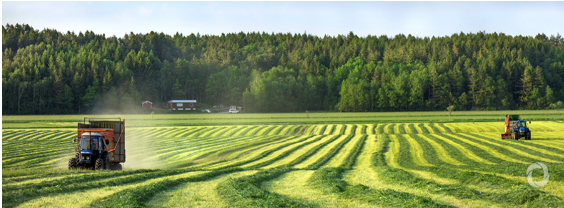
WATER AND LANDSCAPES